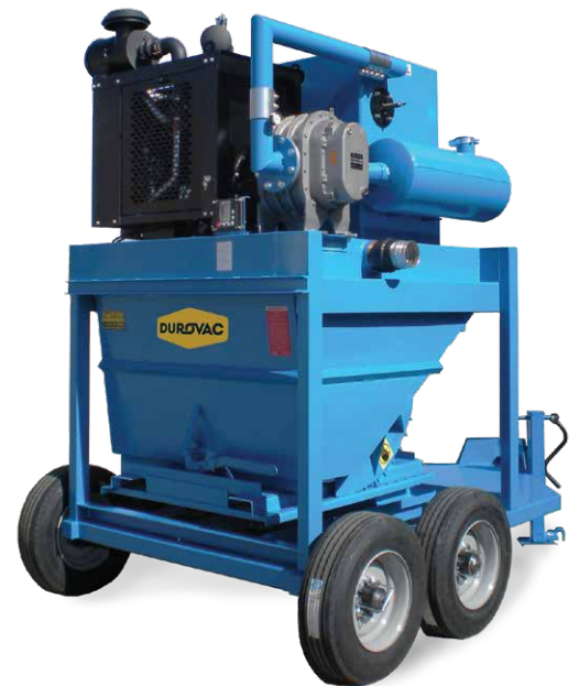
A PowerLift® industrial vacuum system solves large cleaning problems. Here's a 73 Hp diesel with a 2.5 yd 3 hopper.

Let us help you select a durable industrial vacuum that just keeps on working.